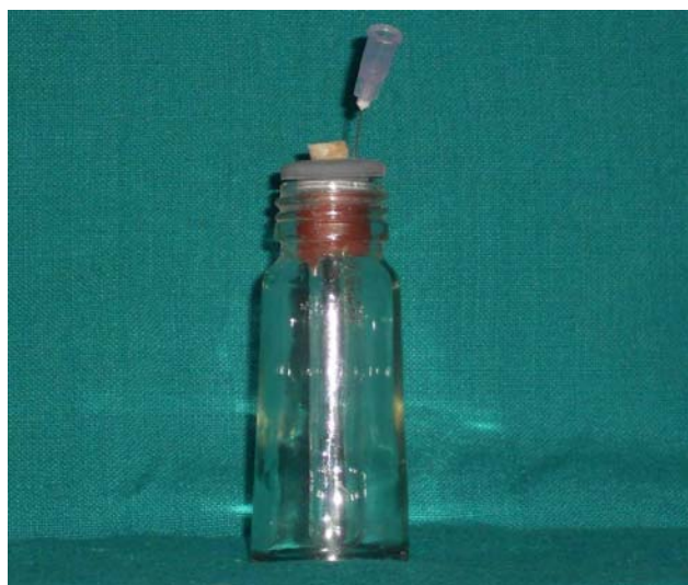
Figure 1. Test apparatus for debris collection.

the upper rim of the collection vial. A 25-gauge needle was placed alongside the stopper during insertion to equalize the air pressure inside and outside the flask. The tubes were numbered. A rubber dam was placed to prevent any bias by the practitioner. This simulated the clinical working environment where the operator is dependent on working length determined by radiographs or electronic apex locators without visualizing the root apex.