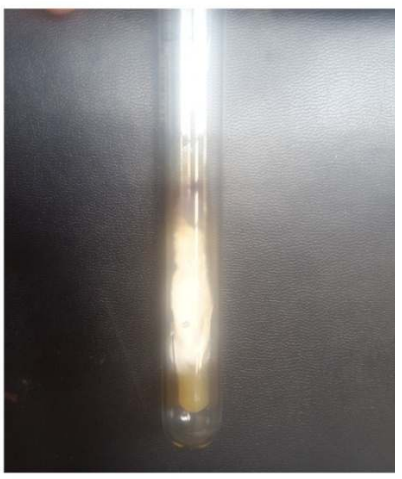
Fig 1(b). Buff brown colonies of Histoplasma capsulatum on Sabouraud's dextrose agar at 25°C, after 1 week of incubation