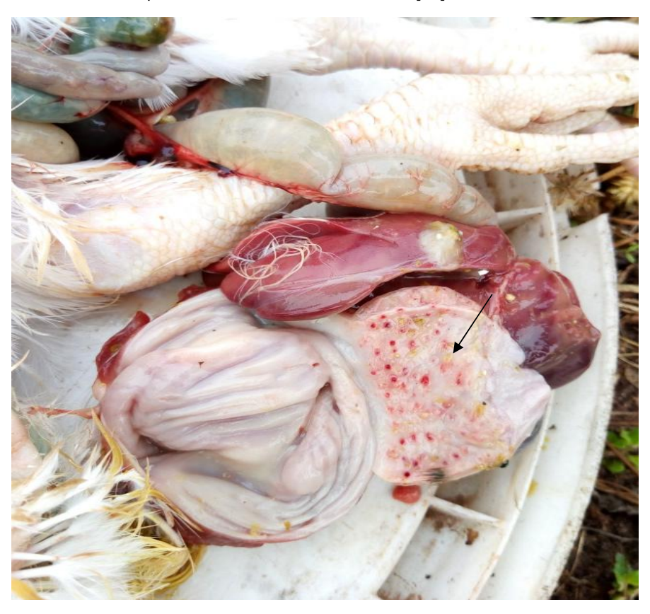
Plate 1. Petechial haemorrhage in the proventriculus (marked by arrow)

These compounds exert their virucidal effect by interfering with viral multiplication [17]. Specifically, some of these compounds are speculated to exhibit protease inhibition, hence interferes with cleavage of haemaglutinin neuramidase and fusion protein, which are important glycoproteins for ND virus attachment and multiplication [18]. Other classes of compounds such as flavonoids from plant extract have been reported to act by inhibiting production of prostaglandin (signaling molecule) and phosphosdiesterases involved in cell activation [13].