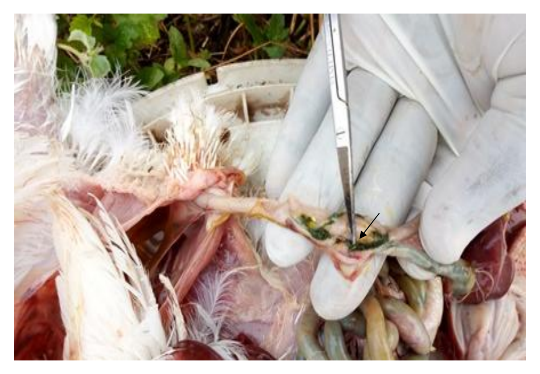
Plate 3. Haemorrhage in caecal-tonsils (marked by arrow)