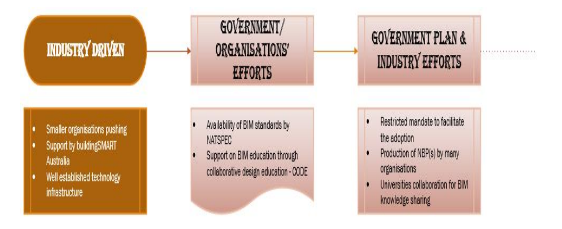
Fig. 3. The Australia efforts to adopt BIM