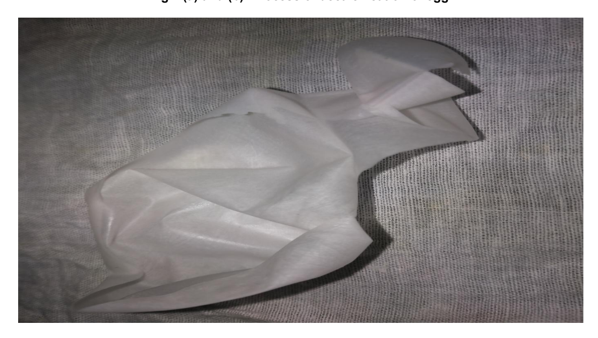
Fig. 3. Prepared semipermeable membrane from egg