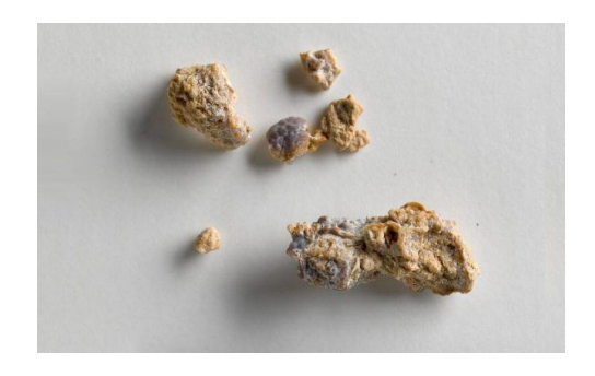
Fig. 1. Kidney stones

Urinary stones are solid masses composed of a collection of small crystals (Fig. 1) which are formed and present in the urinary tract, due to the agglomeration of some components in the urine under certain physicochemical conditions. Urinary stone disease has a great influence on human health and is a disease with a high likelihood of recurrence (or recurrent at a rate of more than 10% within a year).