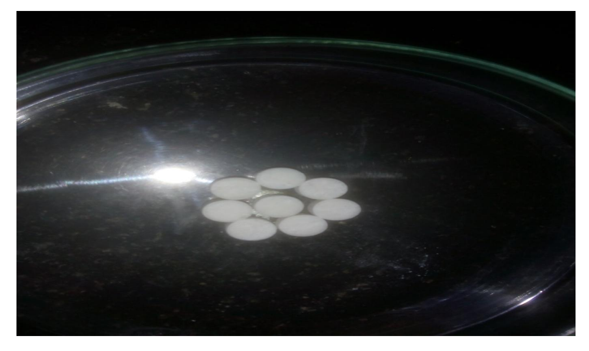
Fig. 5. Calcium phosphate tablets