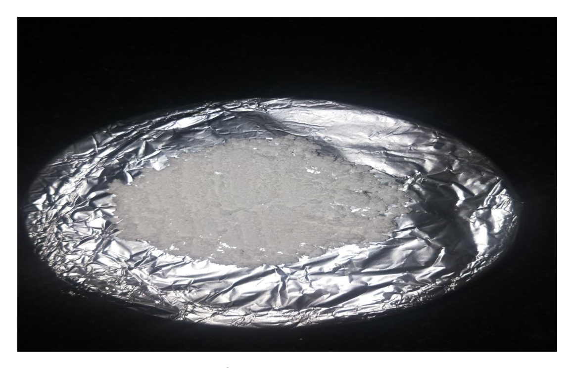
Fig. 4. Calcium phosphate crystals