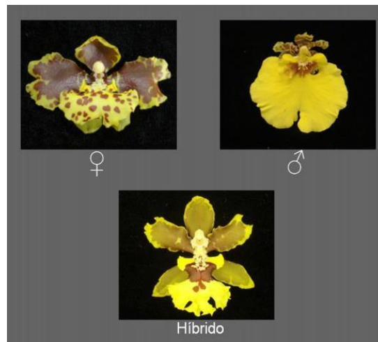
Fig. 3. Oncidium sarcodes (female parent, image top left), Oncidium Aloha 'Iwanaga' (male parent, upper right image) and hybrid (central bottom image) obtained from the artificial crossing