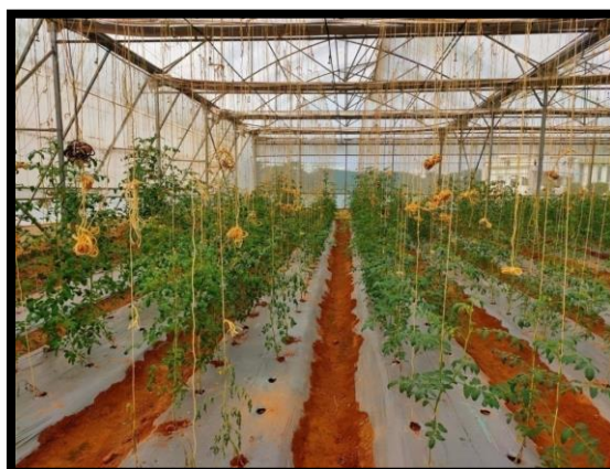
Plate 1. Field view of screening of tomato germplasm lines against fusarium wilt and tomato leaf curl virus diseases in naturally ventilated poly house conditions