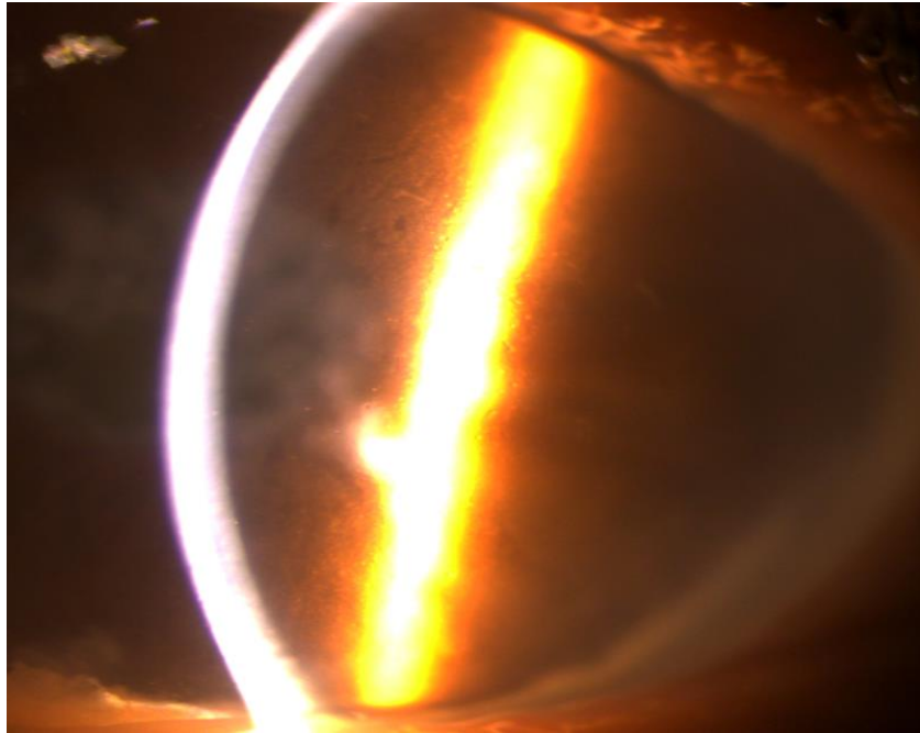
Fig. 1. Slit lamp image showing an inflammatory tyndall in the anterior chamber

Treatment is based on the early introduction of steroidal anti-inflammatory agents, using a combination of topical and systemic routes, to reduce the likelihood of secondary inflammatory complications and avoid affecting the prognosis of cataract surgery.