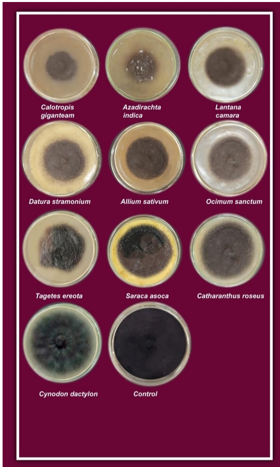
Plate 1. Influence of plant extract on radial growth and inhibition of Alternaria solani after seventh day of incubation