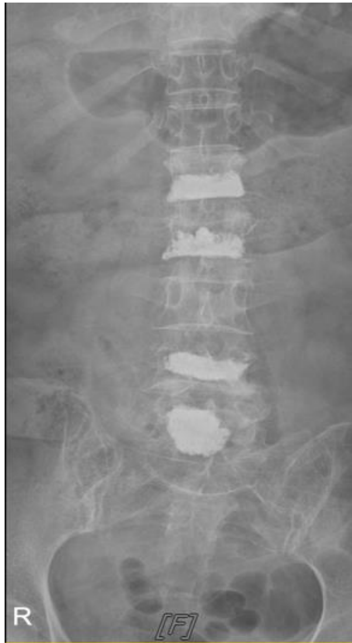
Fig. 4. Follow up anteroposterior view of plain radiograph. Post-vertebroplasty state at L1, L2, L4 and L5

therapy inadvertently compromises both the quantity and quality of bone. Moreover, glucocorticoids have a direct catabolic effect on muscles, resulting in the loss of muscle mass and strength. This condition increases the risk of falls and fractures [8]. Fortunately, if glucocorticoid therapy is discontinued, the fracture risk significantly decreases to baseline within a year [6]. Therefore, the most effective way to prevent GIOP-related fracture is to discontinue glucocorticoid use. However, there are patients for whom this may not be feasible.