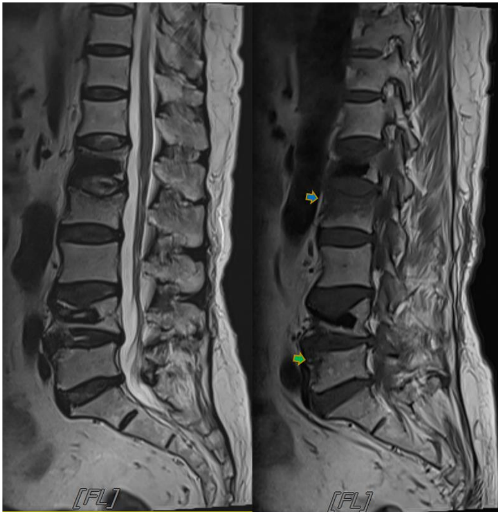
Fig. 3. New L-spine MRI taken on September 3 rd . A parasagittal T2 & T1-weighted images show a compression fracture with bone marrow edema, suggestive of recent fracture, at L2 vertebra (Blue arrow) and suspicion of compression fracture at anterior portion of L5 vertebra (Green arrow)