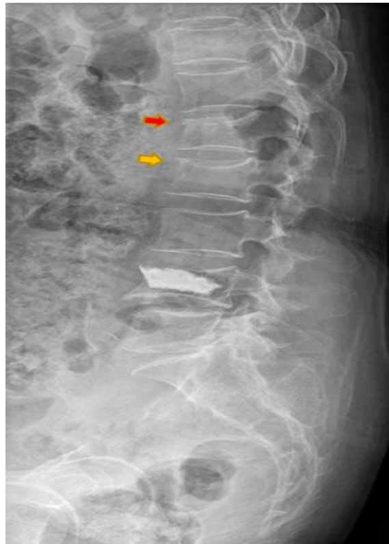
Fig. 2. Lateral view of plain radiograph. The upper endplate of not only L1 (Red arrow) but also L2 vertebral body (Yellow arrow) was slightly lowered

On the outpatient visit on September 27th, the patient reported well-controlled pain with a VAS score of 2. However, on the way home, she experienced severe lower back pain again and promptly visited the Emergency Room. Upon examination with L-spine computed tomography, a newly noted compression fracture at the L3 vertebral body was observed (Fig. 5). Currently, the patient is undergoing conservative treatment (medication, back brace) as requested.