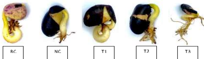
Fig. 1. Effect of Methylobacterium symbioticum and Xanthobacter autotrophicus on germination of Phaseolus vulgaris after 9 days of sowing in soil polluted by 26,990 ppm of waste motor oil

*n=6 **different letters showed statistically different according to ANOVA/Tukey p<0.05%.