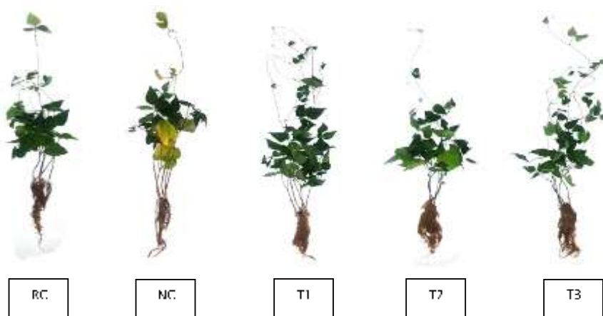
Fig. 3. Phenology of Phaseolus vulgaris enhanced with Methylobacterium symbioticum and Xanthobacter autotrophicus at pre-flowering in the phytoremediation of soil polluted by 3000 ppm of waste motor oil (WMO)

*n=6 **different letters showed statistically different according to ANOVA/Tukey p<0.05%.