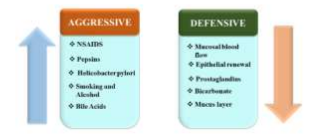
Fig. 3. Peptic ulcers disease (PUD) general pathophysiology

causes of peptic ulcer illness is Helicobacter pylori. The organism is acquired in an unhygienic and condested environment throughout childhood. In the antrum, H. Pylori induces more severe epithelial cell degeneration and destruction. Ten to fifteen percent of h. Pyloriinfected individuals exhibited increased gastric secretion as a result of hypergastrinemia and decreased antral somatostatin levels, despite the fact that hyposecretion has been linked to the development of gastric ulcers. Histamine secretion rises as a result, and acid or pepsin secretion rises as well [32]. Mucosal atrophy and hypochlorhydria are linked to stomach ulcers. NSAIDS change the phospholipids in mucus, which leads to the uncoupling of mitochondrial oxidative phosphorvlation. Mucosal injury is co-administration decreased by of cyclooxygenase-2 (cox-2) and exogenous prostaglandins. NSAIDS are protonated and travel across lipid membranes to enter epithelial cells in response to acidic gastric juice (Ph 7.4), where they ionize and release h+. NSAIDS become hazardous because they are unable to get through the lipid barrier [42].