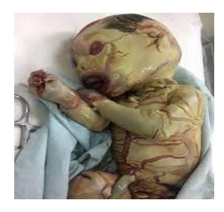
Fig. 1. Appearance of Harlequin Ichthyosis

Harlequin ichthyosis, an exceptionally rare and severe genetic skin disorder, stands as a poignant example of the intricate relationship between genetics, skin biology, and clinical manifestation. This congenital condition belongs to the broader spectrum of ichthyoses, a group of hereditary skin disorders characterized by aberrant scaling and thickening of the skin. Harlequin ichthyosis, in particular, represents one of the most severe and visually distinctive forms within this spectrum, captivating the attention of researchers, clinicians, and the medical community as a whole. With an estimated incidence of just one in several hundred thousand births, Harlequin ichthyosis remains a medically and genetically intriguing anomaly. This disorder's origin in a genetic mutation affecting the ABCA12 gene, crucial for the formation of the skin barrier. Mutations in this gene lead to a deficient production of the lipid transporter ABCA12, which is pivotal in the complex process of skin development and maintenance [1,2].