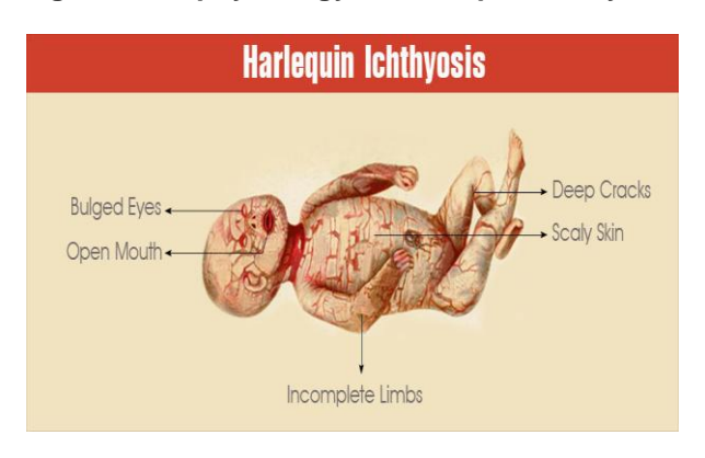
Fig. 3. General symptoms shown in Harlequin

shed these scales effectively and maintain appropriate moisture levels contributes to the severe dryness and cracking seen in Harlequin ichthyosis [6].