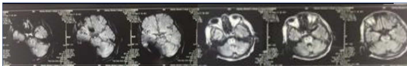
[Table/Fig-4]: MRI brain 11 th POD showing ODS, embolic infarct, hepatic encephalopathy.

On the 6 th day, the patient developed sudden Supraventricular Ventricular Tachycardia (SVT) with a heart rate of 190/min BP-74/50 mmHg. Carotid massage was given. Inj. Amiodarone loading dose 300 mg was given. The arrhythmia reverted in three minutes. Since then, the patient was drowsy and became comatose by 8 th day he was managed with mechanical ventilation. MRI brain, done on the 11 th POD, showed features suggestive of acute embolic infarct involving left middle frontal gyrus, bilateral gyri, right frontal white matter (lacunar) and left precentral gyrus (lacunar), extrapontine myelinosis due to osmolyte imbalance, hyperintensity in transverse pontine fibres [Table/Fig-4].