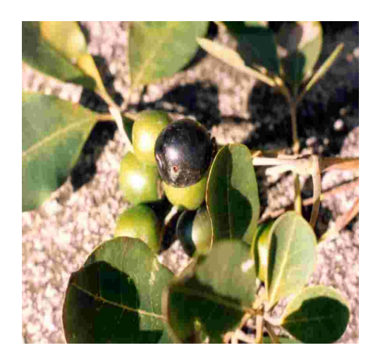
Plate 2a. Vitex doniana