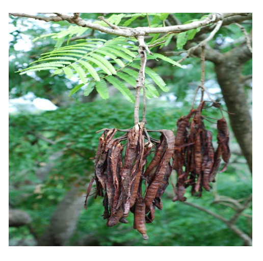
Plate 2b. Parkia biglobosa