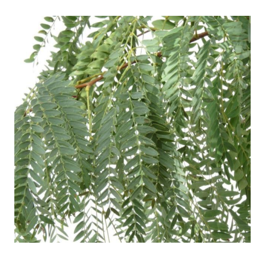
Plate 1b. Prosopis africana