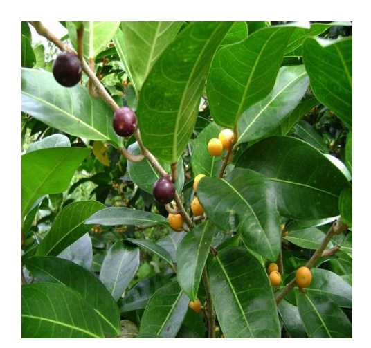
Plate 3a. Ficus vollis