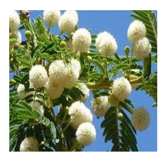
Plate 1a. Acacia sieberiana