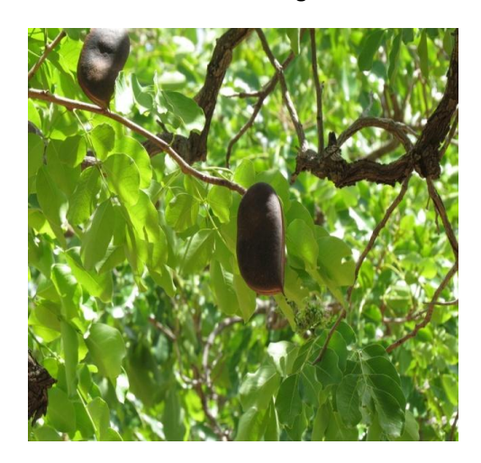
Plate 3b. Afzelia africana