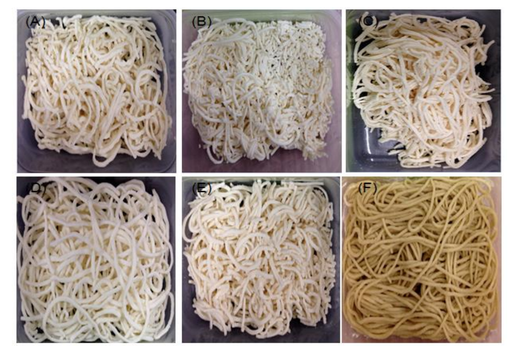
Fig. 2. Noodles made from each flour sample (A) Akitakomachi flour, (B) Koshihikari flour, (C) Haenuki flour, (D) Hitomebore flour,

Gumminess value is determined by multiplying cohesiveness value with breaking strength. Noodle made from Hitomebore flour showed higher gumminess of 371.7 gf, followed by that made from medium wheat flour (333.1 gf) whereas that made from Haenuki flour showed the lowest value (60.1 gf) (Table 2).