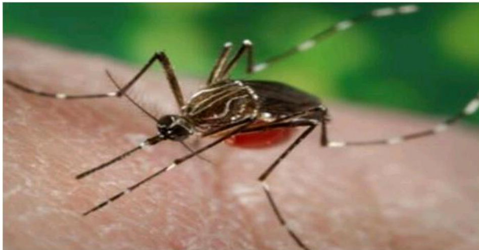
Fig. 1. Pictorial representation of Aedes aegypti [26]

Diagnostic testing of flavivirus infections also include an acute-phase serum sample collection as early as possible after onset of illness and a second sample collected 2 to 3 weeks after the first onset [27] Reverse-transcriptase PCR can also be used to detect Zika virus within 1 st week of onset of illness (in blood and serum) to 2 weeks after (in urine) because immunoglobulin (IgM) and neutralizing antibodies typically develop toward the end of the first week of illness, hence an ELISA has been developed at the Arboviral Diagnostic and Reference Laboratory of the center for Disease Control and Prevention (Atlanta, USA) to detect IgM to ZIKV [27].