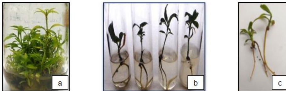
Fig. 1. a. 5-6 years old elongated in-vitro shoots of Garcinia indica regularly subcultured on Multiplication media b. In-vitro rooting on medium supplemented with WPM + 1.5% Sucrose + 0.4% Phytigel with 500 mg/L IBA dip for 48 hrs. c. Adventitious root system after in-vitro root induction

In-vitro root induction was noticed between 20-30 days at 300-400 mg/L of IBA treated shoots. Callus formation was not seen in these shoots at any of the IBA concentrations. Only 15-20% of shoots demonstrated rooting at these said concentrations of IBA. However, shoots which were treated with 500 mg/L of IBA for 48 hours, root induction was observed within 15-20 days directly from the shoot base (Fig. 2a). Out of 24, 48 and 72 hours incubation with IBA, shoots treated for 48 hours were healthier and showed rooting. Hence, 48hours incubation time was seen to be optimum for the present study (Fig. 2a). Maximum of 30% rooting was observed for shoots supplemented with 500 mg/L IBA concentration (Fig. 2b). Shoots supplemented