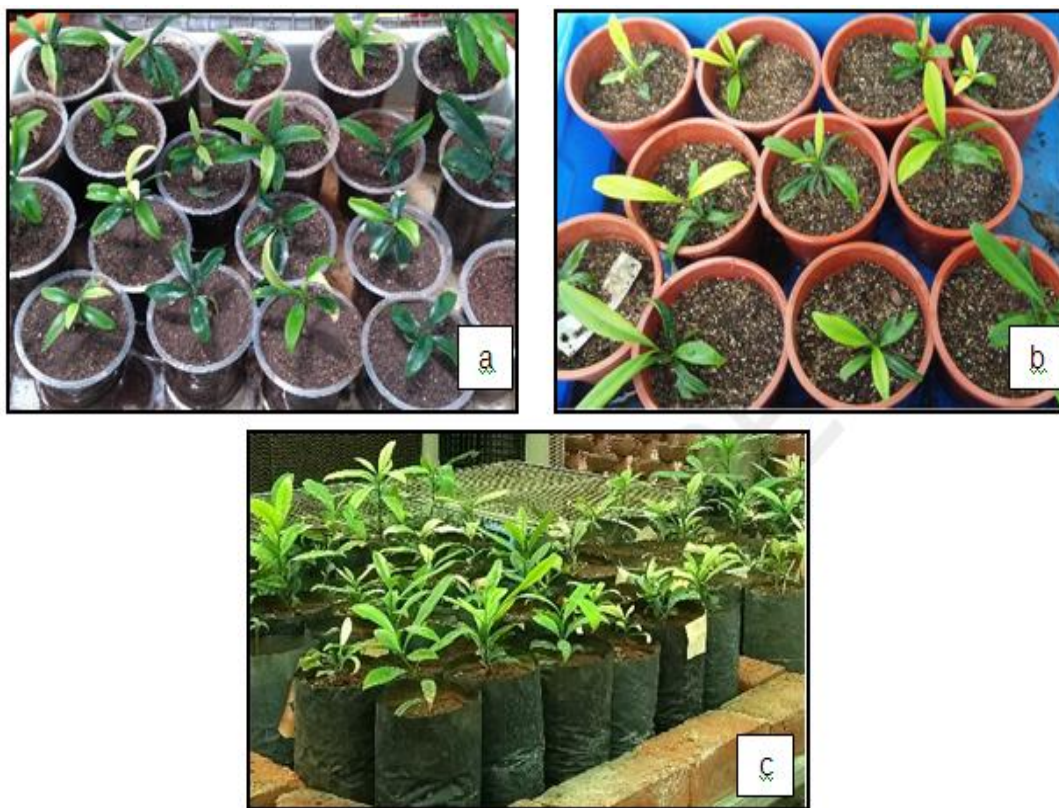
Fig. 4. a. Shows shoots planted in cups after rooting treatment. b. Survived, rooted plants transferred from cups to pots to enhance root growth. c. Successfully rooted plants transferred to black polythene bags and maintained in Low-cost polyhouse, ready to be supplied for field trials in natural locations around Konkan region of Maharashtra

polyhouse in plastic cups (Fig. 4a). After 2 months of hardening in humidity controlled normal polyhouse the plantlets were shifted to bigger pots (Fig. 4b) and they were transferred to low cost polyhouse (data will be discussed in next paper) for further acclimatization. After 8 months the length of these roots ranged from 20 to 34cm and these acclimatized plants in pots were shifted to black polythene bags (Fig. 4c). It has been planned to transport these plantlets for the field trials at their native locations once the monsoon set-in in June 2019 in India.