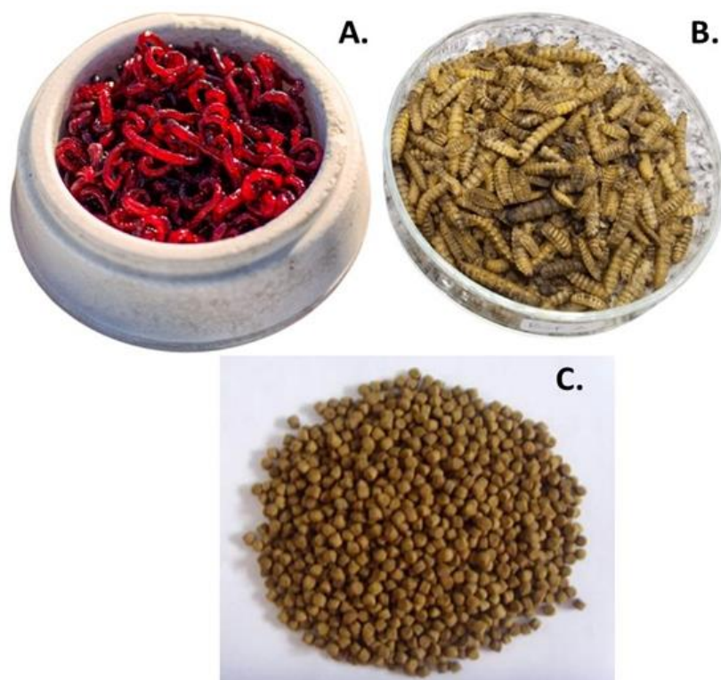
Fig. 1. A) Bloodworm larvae (Chironomidae), B) Black Soldier Fly larvae ( Hermetia illucens ), and C) Commercial pellet

This study was carried out at the Fisheries Research Institute Glami Lemi (FRIGL) in Negeri Sembilan, Malaysia, within 35 days (d) from July to August 2023. For the feeding trials, a total of 360 red hybrid tilapia ( Oreochromis spp. ) fingerlings weighing 0.62 \pm 0.06 g were obtained from the Tilapia Unit at the FRIGL. Prior to the trial, the fish were stocked for three days in circular tanks at the Hatchery Complex, FRIGL, for acclimatization. At the start of the experiment, the fingerlings were starved for 24 hours, weighed, and then randomly