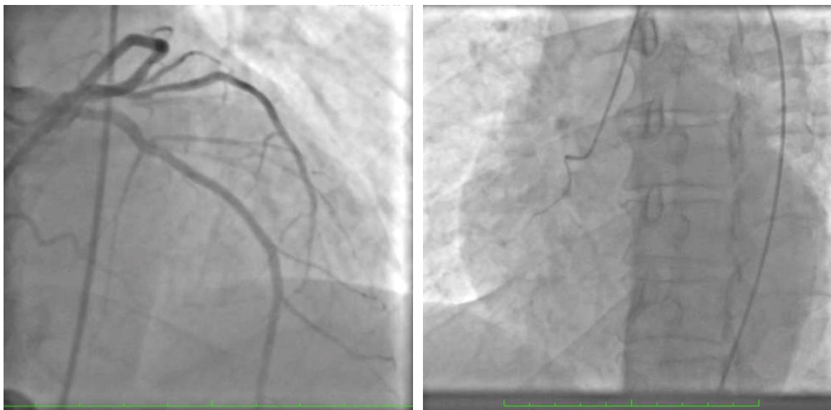
Fig. 2. The coronary angiography showing a left dominance network with no significant atheromatous lesions