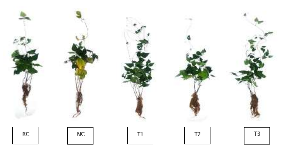
Fig. 3. Phenology of Phaseolus vulgaris enhanced with Methylobacterium symbioticum and Xanthobacter autotrophicus at pre-flowering in the phytoremediation of soil polluted by 3000 ppm of waste motor oil (WMO)

*n=6 **different letters showed statistically different according to ANOVA/Tukey p<0.05%.