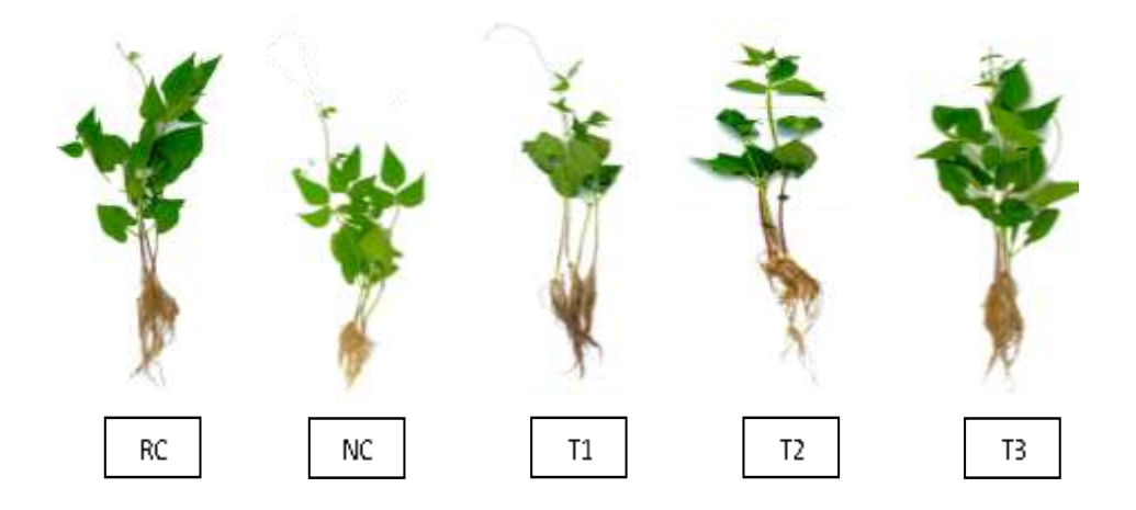
Fig. 2. Phaseolus vulgaris phenology enhanced with Methylobacterium symbioticum and Xanthobacter autotrophicus to seedling during phytoremediation of soil polluted by 26,990 ppm of waste motor oil after 50 days

*n=6 **different letters showed statistically different according to ANOVA/Tukey p<0.05%.