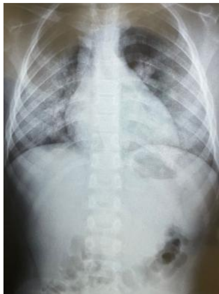
Fig. 2. Chest x ray of case number 3 showing diffuse alveolar