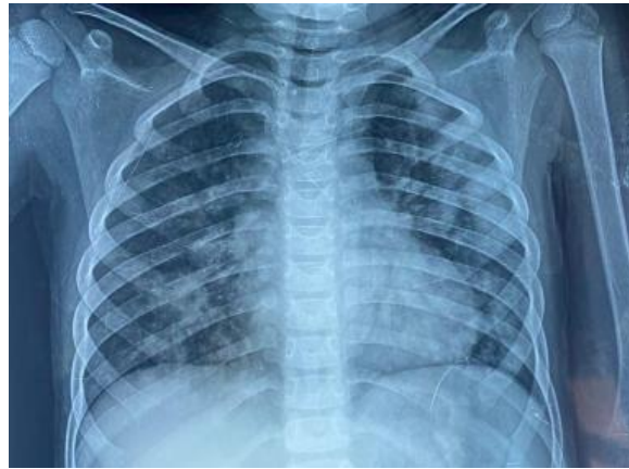
Fig. 1. Chest x ray of case number 1: diffuse alveolar opacity