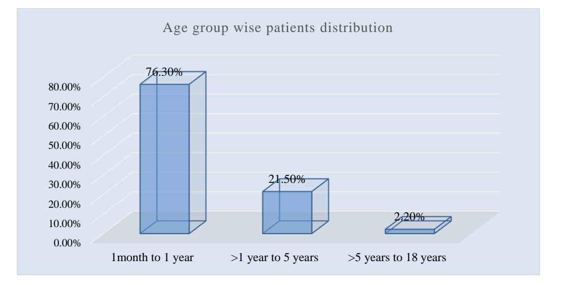
Fig. 2. Colum chart showed age group wise patients (N=135)