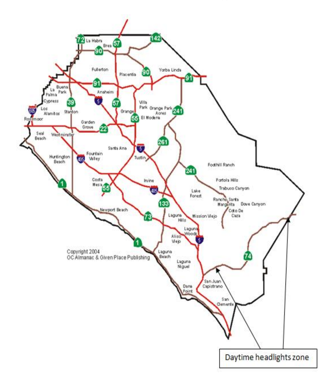
Fig. 5. Orange County, California Highways (www.ocalmanac.com/images/Map_OC_Hwys.gif)

Cottrell; AJARR, 15(4): 25-34, 2021; Article no.AJARR.70152