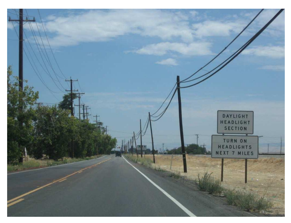
Fig. 2. CA 4 daylight headlight zone entry point near Brentwood, California (www.aaroads.com/california/images004/ca-004_eb_brentwood_18.jpg)