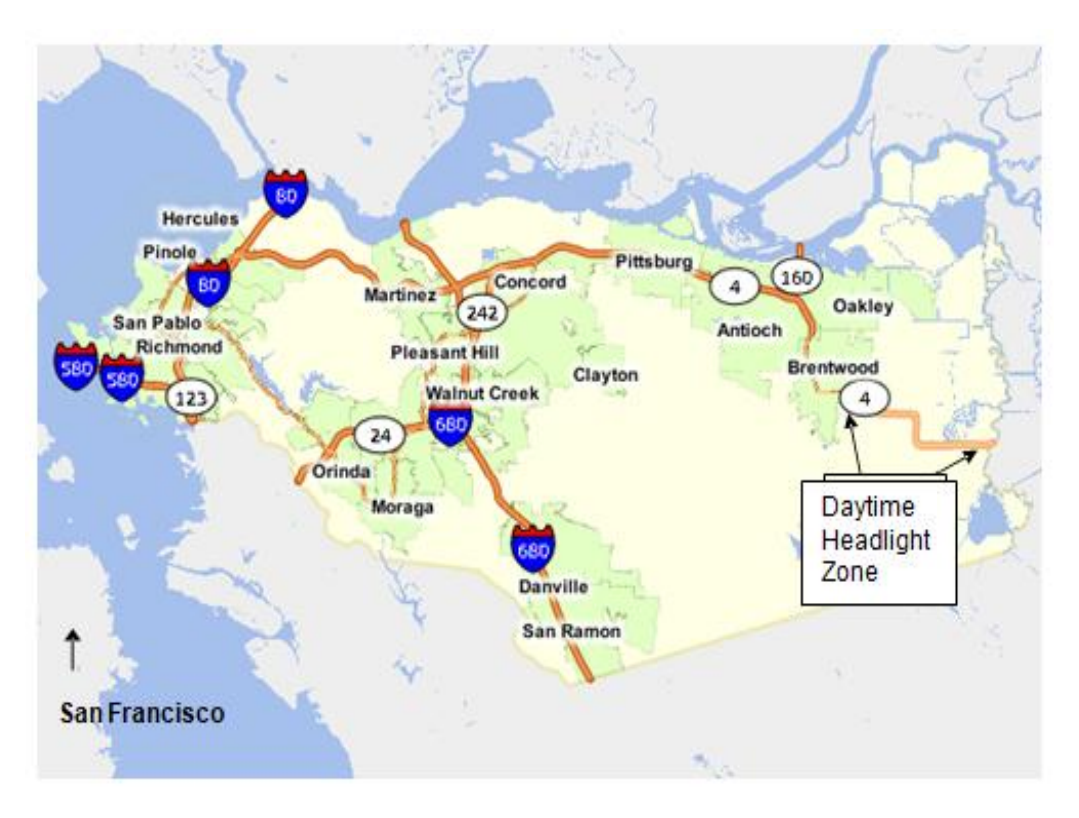
Fig. 1. CA 4 daylight headlight zone, eastern Contra Costa County, California (http://ccmap.us/gis/)

Cottrell; AJARR, 15(4): 25-34, 2021; Article no.AJARR.70152