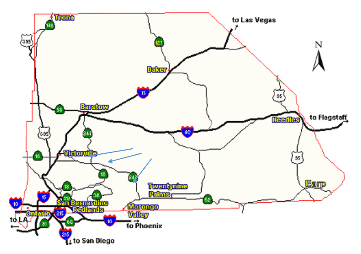
Fig. 3. Daytime headlights zones in San Bernardino County, California: CA 18 & CA 247 (www.sanbag.ca.gov/about/maps/sbmap.gif)